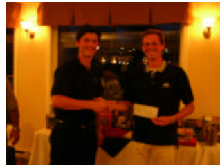
Closest to hole