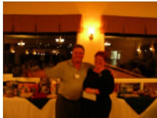
Longest drive ladies