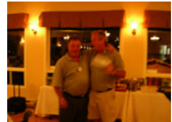
Closest to hole